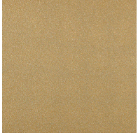
Olive Breeze - 30 (OBR)